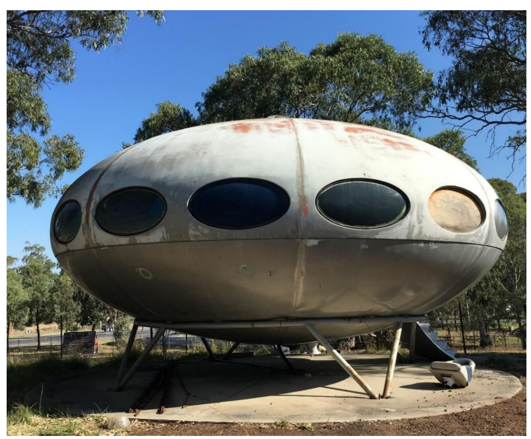
Futuro FSM assembled at South Morang (March 2018)