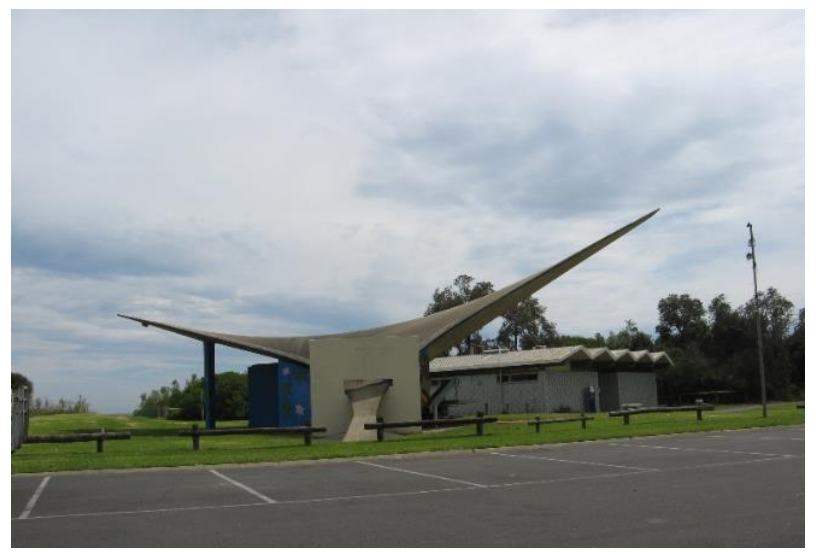
Rosebud Sound Shell (VHR H2299)

988 Point Nepean Road Rosebud, Mornington Peninsula Shire