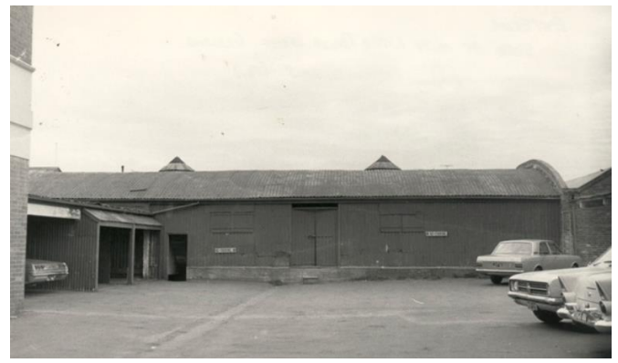
Porter Prefabricated Iron Store (Assembled)

Sovereign Hill, Bradshaw Street Golden Point, Ballarat City