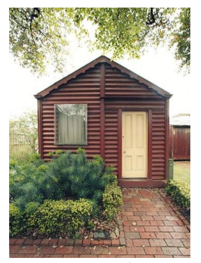
Bellhouse Iron House (VHR H1888)

The Bellhouse Iron House was originally erected around 1853 at 40 Moor Street, Fitzroy. It is of technical and architectural significance as an extremely rare and relatively intact example of the innovative portable iron structures constructed according to the British patented system of Edward Taylor Bellhouse of Manchester. It is the only surviving building by ET Bellhouse in Victoria and Australia and is thought to be one of only two such buildings surviving in the world. The Bellhouse Iron House is located with two other iron houses at the Portable Iron House Museum Site owned by the National Trust of Australia (Victoria).