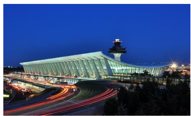
Dulles International Airport in Chantilly by Finnish architect Eero Saarinen (1963) a key chief exponent of mid-twentieth century futurist architecture.