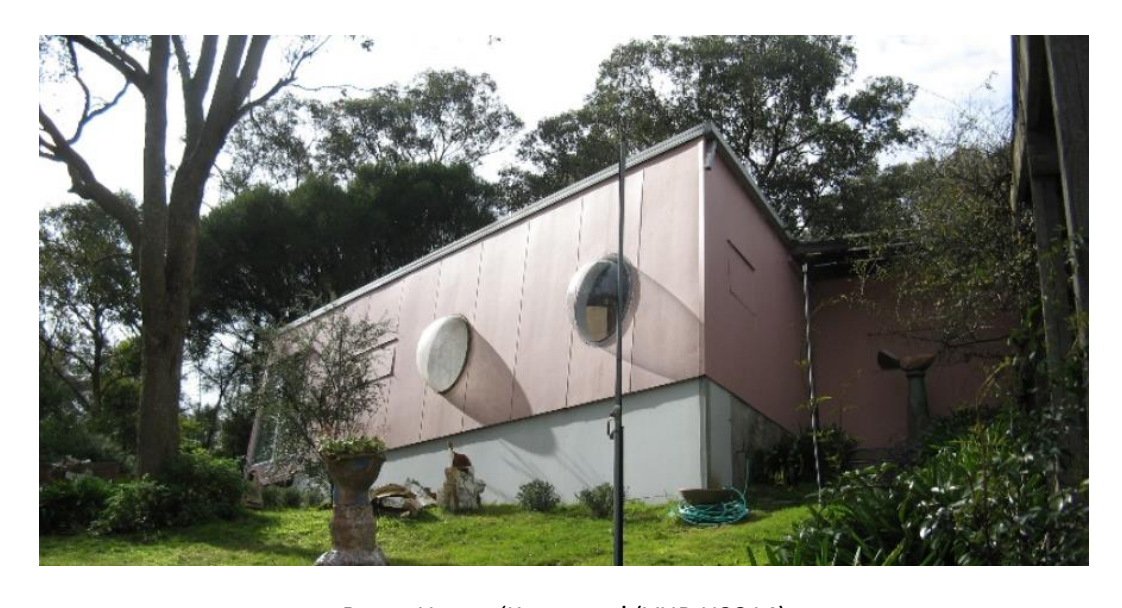
Burns House 'Kangaroo' (VHR H2314)

644 Henley Road, Bend of Islands, Nillumbik Shire