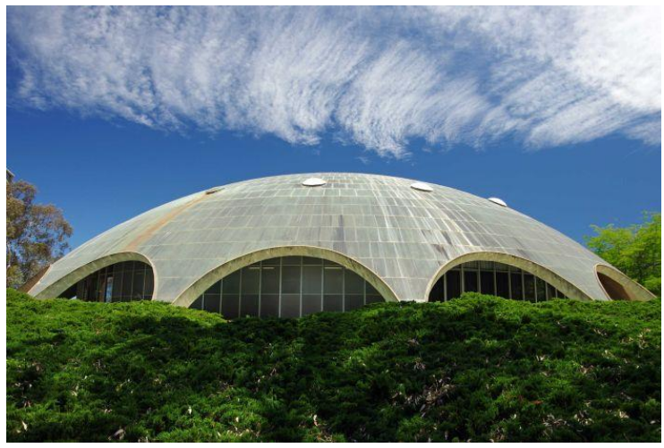
Shine Dome, Australian National University (1959) Architect, Roy Grounds

After World War II, Buckminster Fuller was championing the Geodesic Dome. Light, strong, and cost-effective, the dome covered more space without internal supports than any other enclosure. From this era, interest in domed structures increased partly due to their space age appearance and advances in engineering and building technologies. In Australia, the Shine Dome at the Australian National University, Canberra was built in 1959 to a design of Roy Grounds. It was referred to by locals as 'The Martian Embassy'. The 1960s saw a number of large geodesic domes built internationally as architects explored the possibilities of this style and took advantage of new technologies in building materials and engineering.