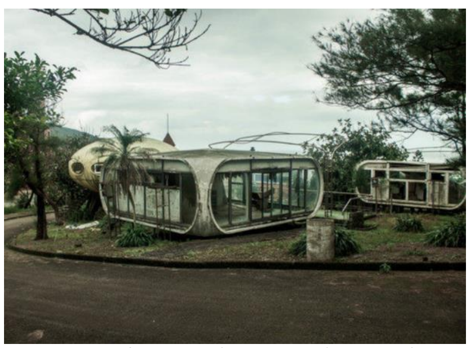
An example of Matti Suuronen's other design the 'Venturo House'.

Name: Futuro House (Formerly of South Morang)