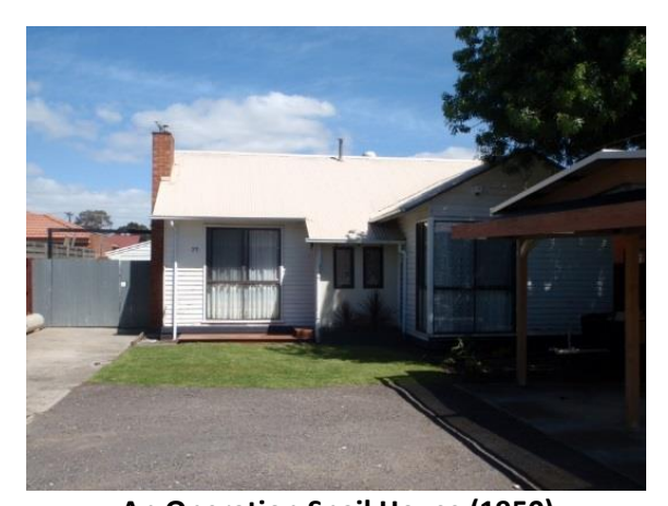
An Operation Snail House (1950) 25 Adelaide Street, Sunshine, McKay Housing Estate (King Edward Avenue) City of Brimbank – No Heritage Overlay

This is an example of a 'Snail House' designed in Melbourne to respond to the need for housing for workers on the Victorian railway and other industries. The Snail Houses were designed in Melbourne and mass produced in Britain in the form of kits of pre-cut and part-assembled timber components which could be speedily erected in the field by a small and largely unskilled labour force.