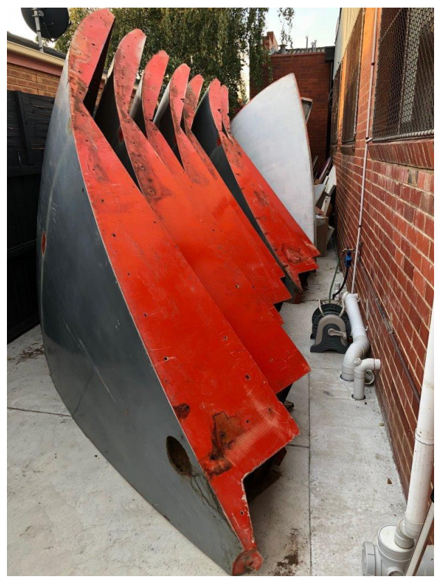
Parts of the disassembled Futuro House FSM (May 2018)