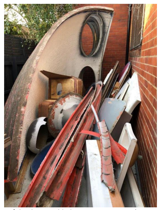
Parts of the disassembled Futuro House FSM (May 2018)