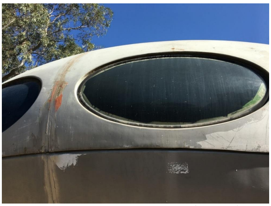
Futuro House FSM bathroom with ellipsoid door (March 2018)