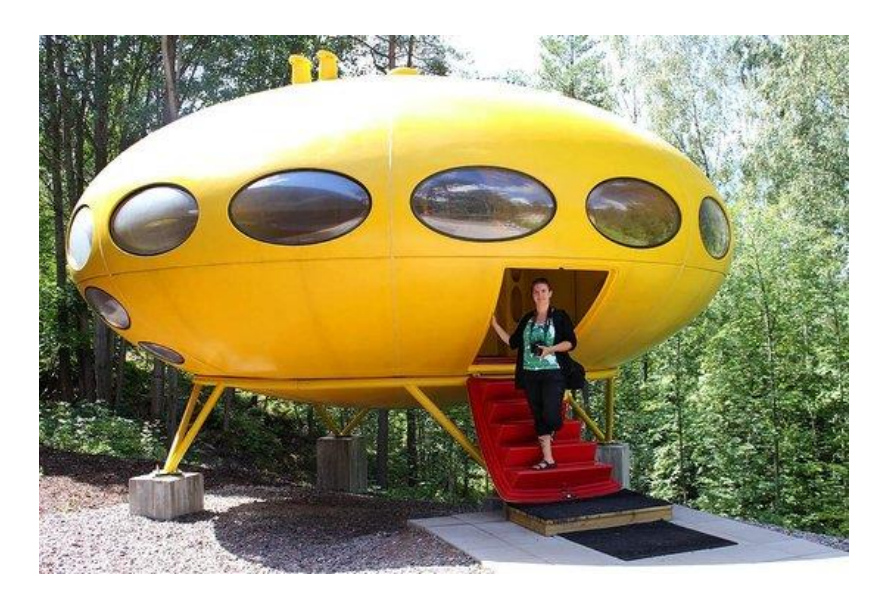
The Futuro House at the University of Canberra.

This is arguably the best example of a Futuro House in Australia. It has been restored by conservation students. Note the additional windows on the lower panels (LHS) which indicates that it was the 'luxury' model. The Futuro House FSM does not have these additional windows.