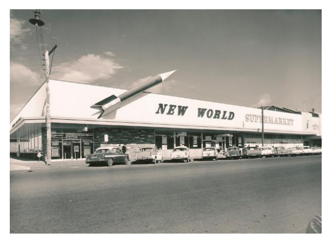
Coles New World Supermarket Geelong, 1967