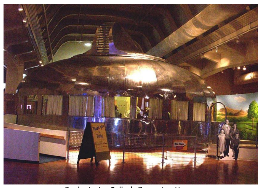
Buckminster Fuller's Dymaxion House On Display at the Henry Ford Museum (developed 1920s-1940s).

Modern 'prefabricated pods' have a history which begins in the early twentieth century. During the 1920s American inventor and architect Buckminster Fuller designed the Dymaxion House to address several perceived shortcomings with existing homebuilding techniques. Fuller's concept, which went through several iterations from the 1920s to the 1940s, consisted of factory manufactured kits, assembled on site, intended to be suitable for any site or environment and to use resources efficiently. A key design consideration was ease of shipment and assembly.