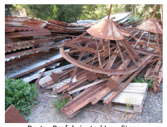
Porter Prefabricated Iron Store (Currently in storage disassembled)

The Porter Prefabricated Iron Store c.1853 is historically significant as a now rare example of the many prefabricated iron buildings which were imported into Victoria during the Victorian gold rushes. It is the only surviving identifiable building made by JH Porter, a pioneer of galvanising, the structural, use of corrugated iron, and prefabrication. Probably manufactured around 1853, is an early example of the use of a building material, galvanised corrugated iron, which was to become closely linked with Australian building, especially for utilitarian buildings.