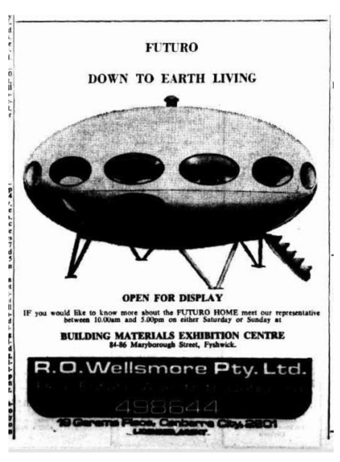
Advertisement for the Futuro House from Canberra Times 1972.

Name: Futuro House (Formerly of South Morang)