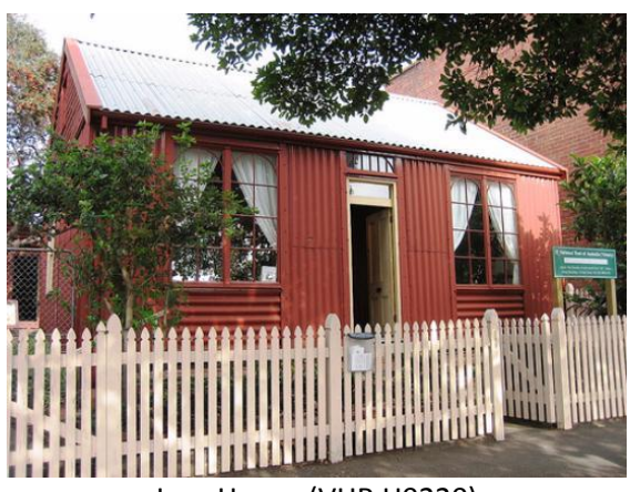
Iron House (VHR H0220)

The Iron House at 399 Coventry Street South Melbourne was imported and erected in 1853 and is still located on the original site. The house is a fine intact example of a building type which proliferated in the gold rush era of the burgeoning Colony of Victoria and is of paramount technological rather than stylistic importance. It is located with two other iron houses at the Portable Iron House Museum Site owned by the National Trust of Australia (Victoria).