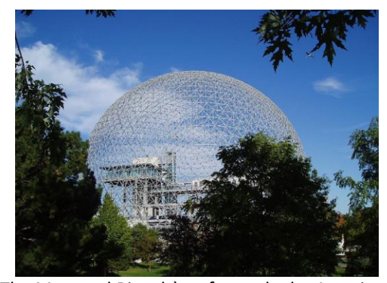
The Montreal Biosphère, formerly the American Pavilion of Expo 67, Quebec (1967) Architect, Buckminster Fuller