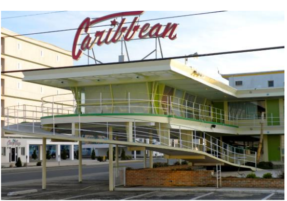
An example of Googie Architecture The Caribbean Motel in Wildwood, New Jersey's Wildwoods Shore Resort Historic District (1957)