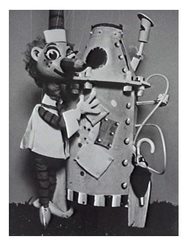
Mr Squiggle and Rocket. The Mr Squiggle Show commenced in Australia in July 1959.