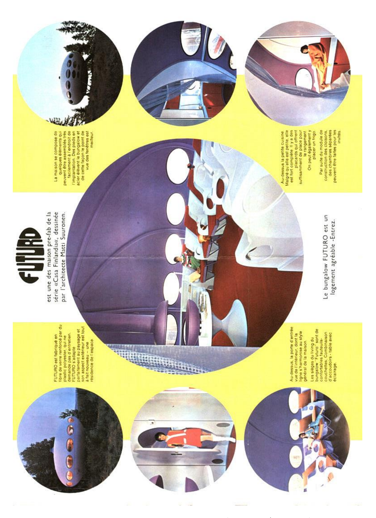
Futuro House Brochure, Finland (c.late 1960s/early 1970s)

Name: Futuro House (Formerly of South Morang)