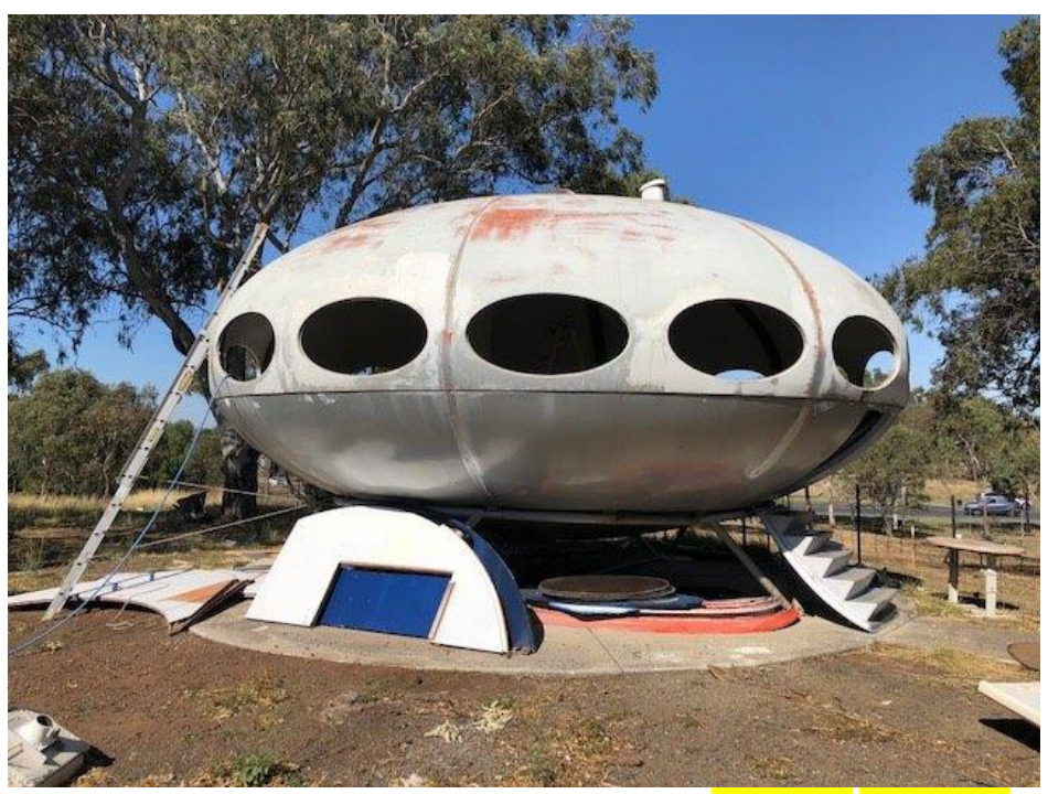
Futuro House FSM in the process of being disassembled (April 2018) CHECK DATE

Name: Futuro House (Formerly of South Morang)