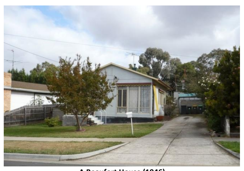
A Beaufort House (1946) 19 Gallipoli Parade, Pascoe Vale South City of Moreland Heritage Overlay, HO425

The 'Beaufort' steel house project was a joint State and Federal government initiative to solve the severe housing shortage experienced in Australia after World War II. Fifty-eight Beaufort houses were built in Victoria and at least half of these were erected in the West Coburg Estate in late 1947 and 1948.