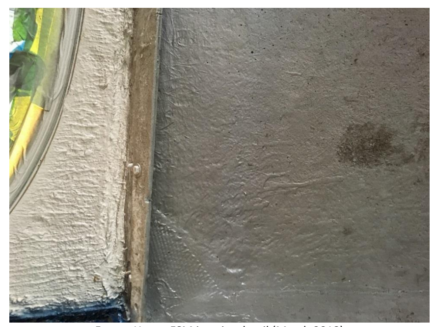
Futuro House FSM interior detail (March 2018)