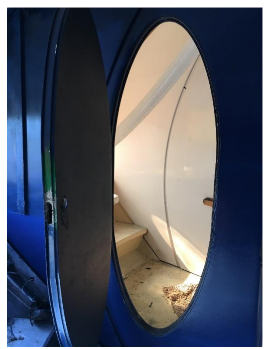
Futuro House FSM ellipsoid window (March 2018)

Name: Futuro House (Formerly of South Morang)