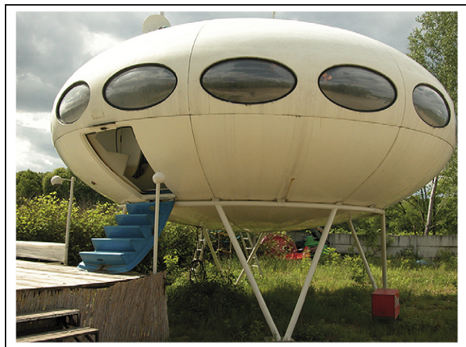
Figure 1. Futuro by the Finnish architect Matti Suuronen, 1965.

The plastic ski-cabin Futuro was designed by the Finnish architect Matti Suuronen in 1965 (Figure 1). The exterior consists of glassfibre-reinforced polyester filled with polyester-polyurethane foam and includes windows of poly(methylmethacrylate) (Perspex). The interior also contains