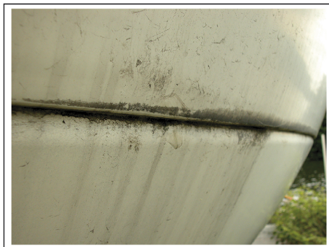
Figure 2. Detail of Futuro showing dramatic evidence of microbial growth.

various plastics. Futuro represents an extraordinary document of its time, of which fewer than 15 examples remain. The Museum Die Neue Sammlung in Munich ( http://www.die-neue-sammlung.de/z/enindex.htm ) is currently conserving 'number 13', which shows significant damage caused by microbial growth (Figure 2), largely due to exposure – the artwork is still located outdoors. Extensive investigations of the degradation processes were carried out by The Museum Die Neue Sammlung, with The Netherlands Institute for Cultural Heritage ( http://www.icn.nl ) performing chemical analysis, and our Department ( http://www.distam.unimi.it ) conducting biotechnological investigations.